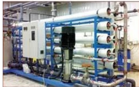
SALT RECOVERY SYSTEM