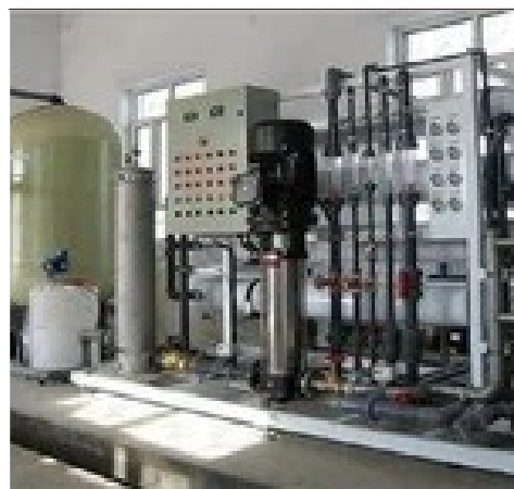
AUTOMOBILE WATER TREATMENT PLANT