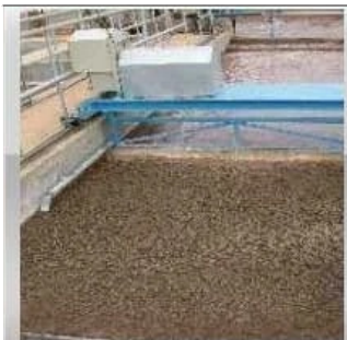
OIL REMOVAL SYSTEMS