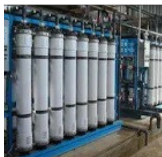
COMMERCIAL ULTRA FILTRATION SYSTEM