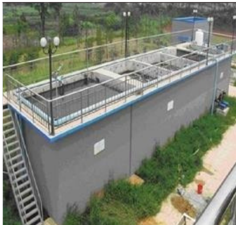
BIO-STP SEWAGE TREATMENT PLANTS