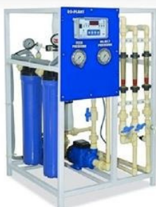
MILD STEEL RO PLANT