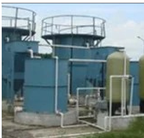
INDUSTRIAL EFFLUENT TREATMENT PLANT