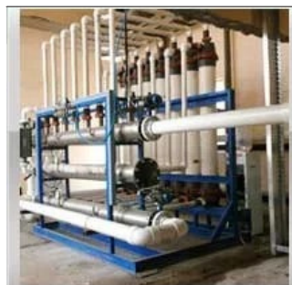
MEMBRANE BIOREACTOR PLANT