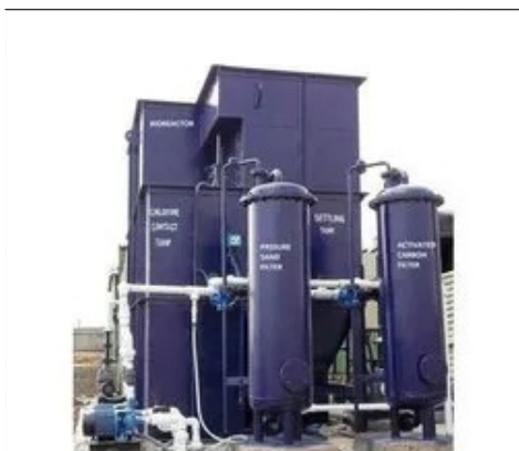
WTE INFRA CHEMICAL GREY WATER TREATMENT PLANT FOR INDUSTRIAL